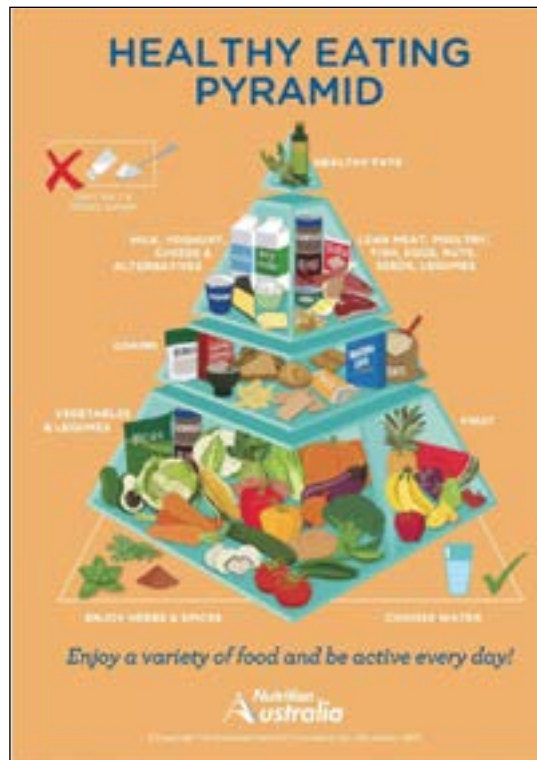
Stay healthy by eating a variety of foods. (Australian Nutrition Foundation)

How different this is from the easy calorie diet most of us enjoy today! Beef, pork or chicken? An occasional meal of fish or shellfish? Corn, wheat, rice or barley (beer)? How many varieties of vegetables and fungi do you