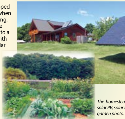
The homestead of G.E.T.'s founder, showing solar PV, solar thermal on the roof and a lush garden photo. (N.R.Mallery)