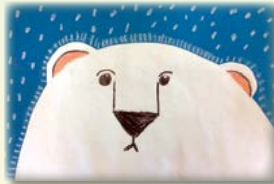
This "Fluffy Polar Bear" represents one of the many reasons to make Earth Day every day -- to save the polar bears. (Ellery, age 6)