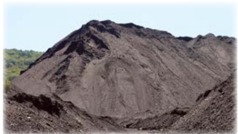
Coal waste pile west of Trevorton, Pennsylvania.

Ohio University awarded $2 million from Department of Energy to develop products from coal waste