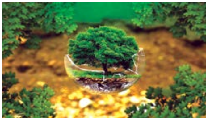
We can prosper and save the earth at the same time. ( singularityhub.com )

Cigarettes did not get any safer or less addictive when Philip Morris "rebranded" as Altria. Facebook did not get any less polarizing when it changed its name to Meta. Nuclear power is not any more appealing to Vermonters just because it is rebranded as carbon-free. A proposal in the Department of Public Service's 2022